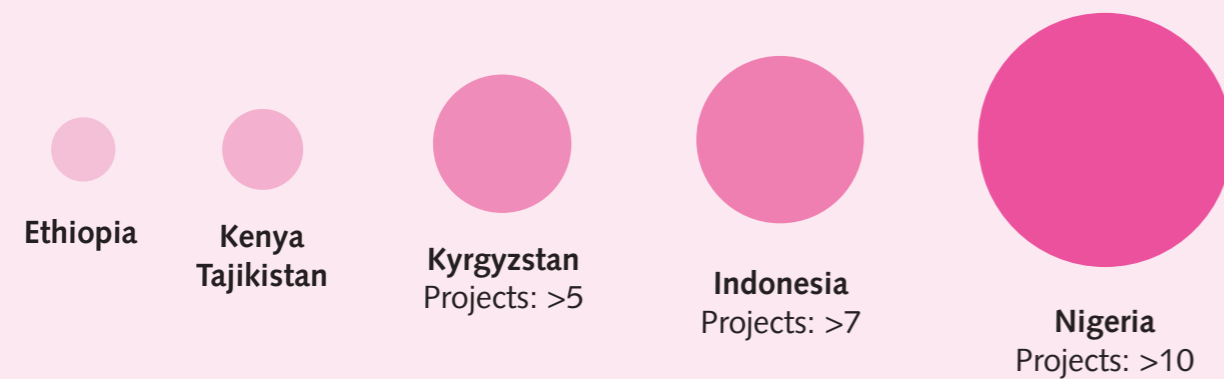
Figure 5: Based on commencement dates, maturity, number of projects and budget.

- was agreed in 2023. The (financially independent) affiliated national entity Office in Tajikistan – KNCV Tajikistan – was finalized in 2023 and the office received the registration certificate from the authorities. The (financially independent) affiliated national entity in Ethiopia is still in the process of registration. The expansion of the KNCV Network ensures that KNCV continues to have a country presence in important high burden countries. KNCV Global has signed a partnership agreement with the respective national entities.