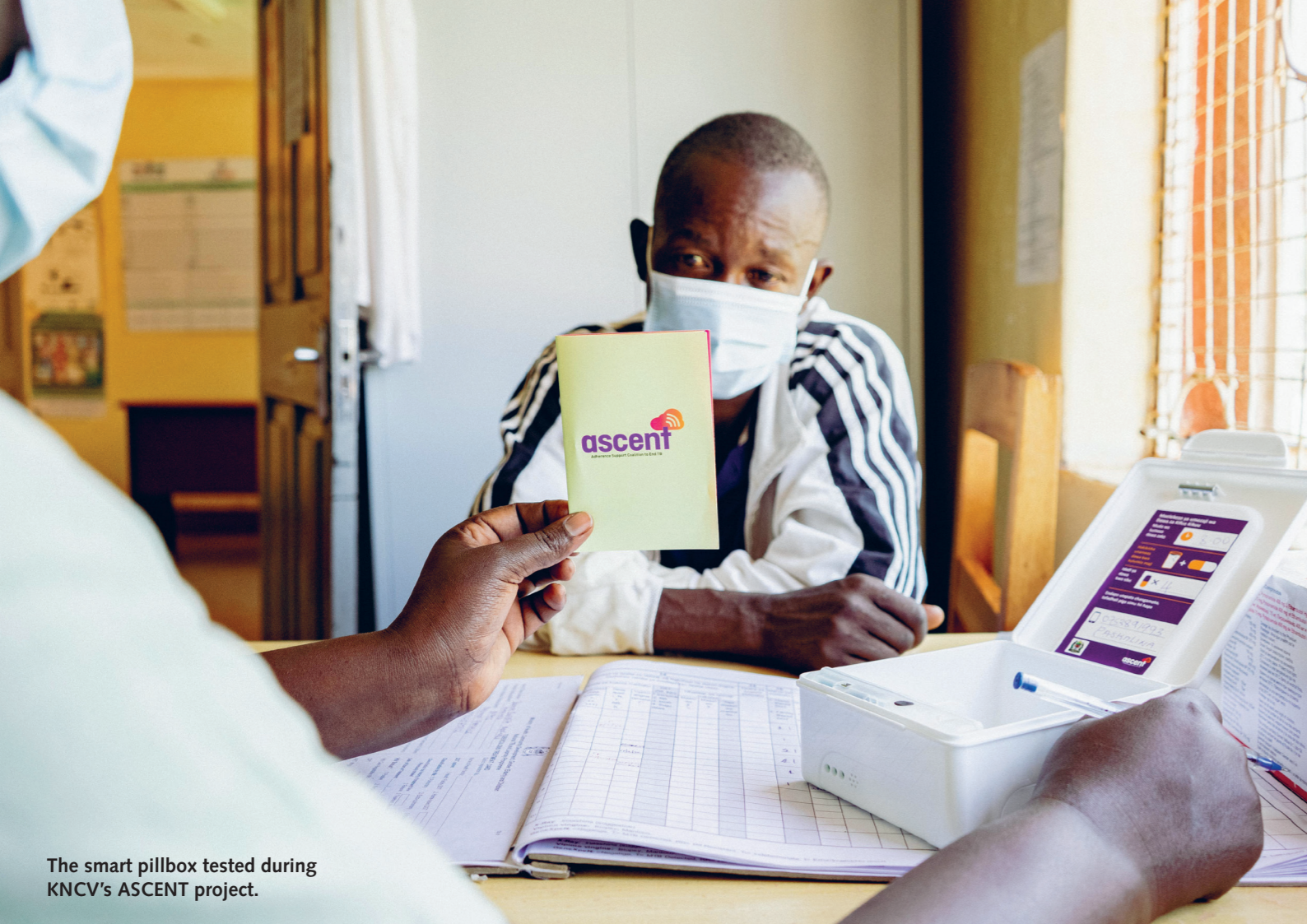
The smart pillbox tested during KNCV's ASCENT project.