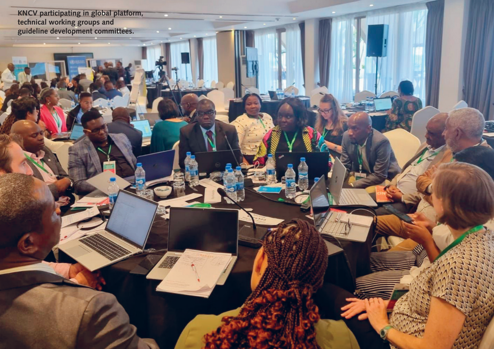
KNCV participating in global platform, technical working groups and guideline development committees.